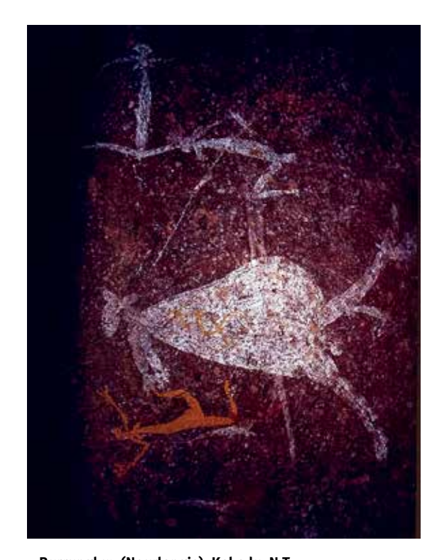
Burrungkuy (Nourlangie), Kakadu, N.T "Rock art is the oldest surviving human art form. Across Australia rock art is an integral part of First Nations life and customs, dating back to the earliest times of human settlement on the continent." National Museum of Australia